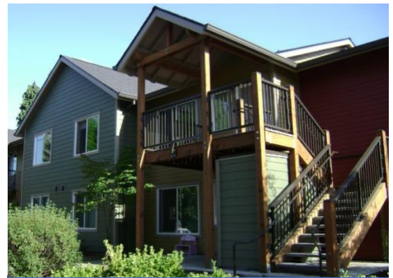
Villa de Sueños, a Hacienda property.

What happens when people integrate non-toxic cleaning into their lives? In the Fall/Winter of 2020, socially distanced, in-person focus groups and bilingual online surveys were held in Hacienda CDC's housing communities to find out. COVID-19 hit the Latino/x community particularly hard, and the increased levels of disinfecting increased families' and kids' exposure to dozens of different toxic chemicals (ie. bleach) in their products. It should not be a cost burden to obtain environmentally healthy, non-toxic, and sustainable cleaning and personal care products. Listening and learning from Hacienda's residents about their purchasing behaviors regarding cleaning and personal hygiene products, 75 residents participated in either focus groups or online surveys. 1 Based on that input, we came up with affordable Spanish and English cleaning and sanitizing recipes and tailored eco-healthy home kits with non-toxic ingredients, and distributed them to these residents. We then surveyed participants a second time in the Spring/Summer of 2021 after they got a chance to use up their eco-healthy home kits. This report shows a significant positive outcome in the health of residents. 2